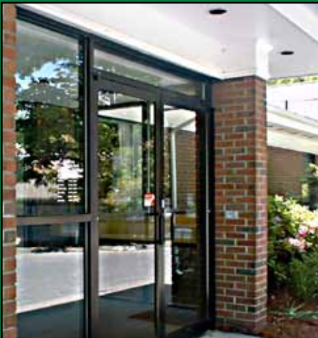
Flexible installation options

Door Lock and it's Power Supply are not included