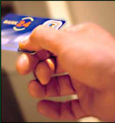
Twenty-four hour vestibule access control